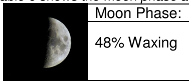
Table 6 shows the moon phase at the time of the investigation.

Note: Moon orbit affects the natural electro-magnetic fields (EMF) of the earth and causes fluctuations. Current theory postulates that spirit activity can be measured using EMF. For this reason we track the moon phase to identify how it alters paranormal activity.